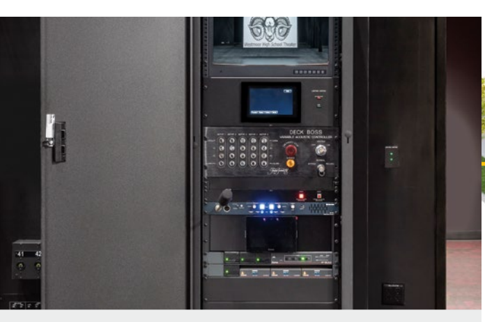
PCD installed a backstage AV rack with a video monitor featuring an audience view of the stage.

PCD installed panels on all four corners of the backstage area for AV access directly to the control room and PA.