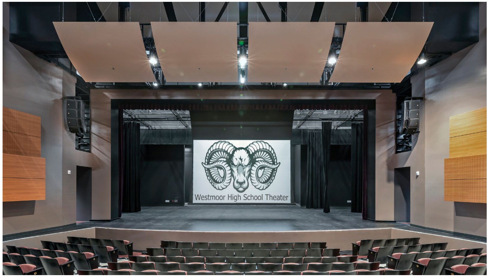
PCD installed a 20-foot wide Draper screen with a rear projector on the stage of the Westmoor Theater.

ceiling. Voices are amplified through the ceiling-mounted speakers. PCD also installed donor-provided TVs and the control panels to turn the TV on and off or the volume up and down.