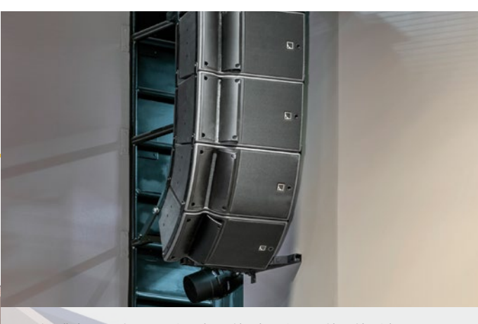
PCD installed L-Acoustics arrays of speakers with subwoofers on either side of the stage.

At Novato High School, PCD also worked on the AV for the new 42,000 sq. ft. Center for the Sciences, which has ten new science classrooms and new labs. They installed FrontRow systems in each of the 10 classrooms in the science building. The FrontRow system is a sound projection/enhancement system for teachers. Each teacher has a microphone around the neck, connected to a sensor in the